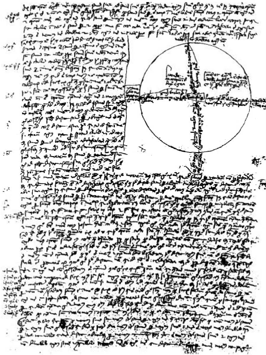
Figure 1.—Ms. Parmense 1065, f. 63r: diagram of the latitude of health according to Albertino Rinaldi de Salso.