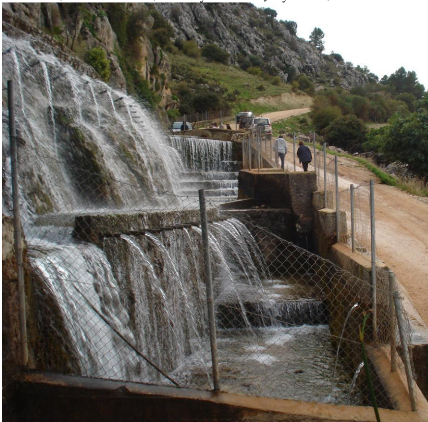
The Hundred Spouts Spring, in the high Guadalhorce river (Málaga)

- Symposium on “Investigaciones en Áreas Kársticas”, during the VIIth Spanish Geological Congress, at Las Palmas, Gran Canaria, Canary Islands. July 14-18, 2008.