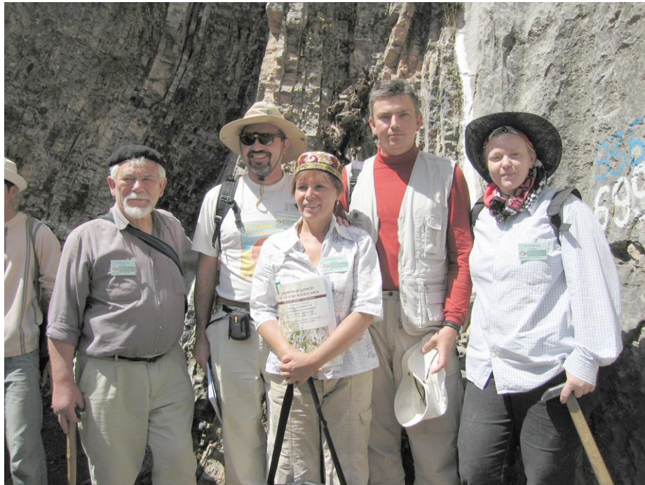
The GSSP of the lower boundary of the Emsian Stage, is included in the white line between the first and second persons to right

Summary: Major contribution of the Spanish Working Group (SWG) has been in the field of fine biostratigraphy, as this aspect of Geology is basic for other endeavours, such as precise chronologic arrangement of geological events that in turn is fundamental for, both palaeogeographical reconstructions and basin evolution. In spite of the fact, that, in many occasions, plate kinematics reconstructions neglect biostratigraphic (or even palaeontological) sound data, as we have seen even in closely related IGCP projects, the need for such scientific effort is unquestionable. Without a sound basis, many interpretations are just nice histories that, may be, by chance can approach reality, but don't expect them to be as beautiful as "fairy tales". The need for cooperation among geological disciplines is obvious and neglect one of them is just, to be blind and to discard (without any ground) important and relevant information. In this respect, basic palaeontology and its applications to biostratigraphy, chronostratigraphy and palaeogeography, is mandatory, as it has been done by the SWG.