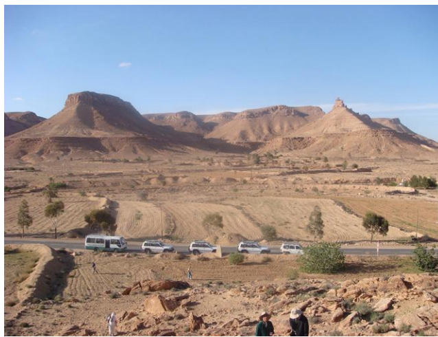
A view of the Jurassic in the southern Tunisian desert

Abstract: During the year 2008, the researches of the Spanish Working Group of the IGCP 506 have been engaged on several topics, which are directly related to the different working areas of the Triassic and Jurassic basins of the Iberian Peninsula (Iberian Chains, Betic Chains, Catalanian Coastal Ranges, Pyrenean Basin and Basq-Cantabrian Basin). During the period 2006-2008 the Spanish Working Group (SWG 506) has presented original works in The 5 th International Symposium of the IGCP 506 . Two doctoral dissertations (the first about Triassic Conodonts of the Iberian Peninsula and the second one about Triassic-Lower Jurassic bivalve genera revision), near one hundred National and International Publications and Congress communications are the results of our research activities as SWG of the IGCP 506. The twenty six actual members of the group are in disposition to keep in these topics in a future project.