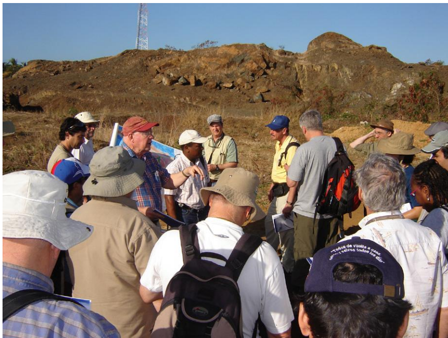
Siete Cabezas Formation, Dominican Republic

Abstract: The Working Group of the IGCP Project nº 546 has organised scientific meetings and Field Workshops, in order to emphasised our knowledge on the subduction zones from the Caribbean Region (Dominican Republic, March 2008), and a seminary related to metamorphic petrology, geothermobarometry and P-T paths, organised for latinoamerican students at Granada, Spain, May 2008.