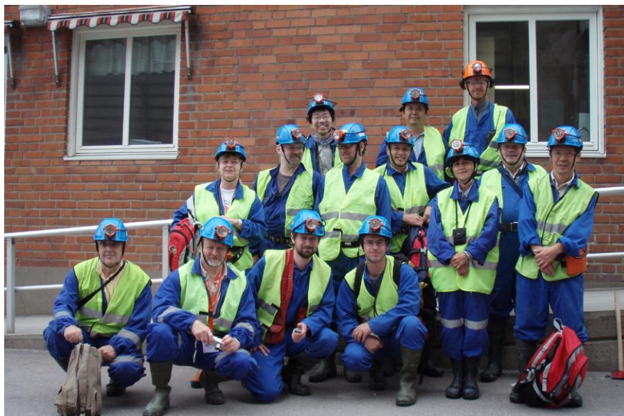
Participants of the visit to the Garpenberg mine (Bergslaggen, Sweden). A field-trip organised by IGCP Project no. 502, during the 33th IGC, Oslo.

The working group has a total of 8 publications. Three chapters of a book published by the Universidad de Huelva, and two contribution to international congress.