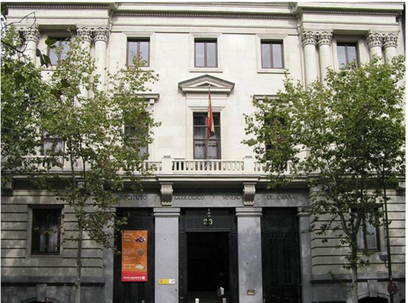
Instituto Geológico y Minero de España. Madrid.