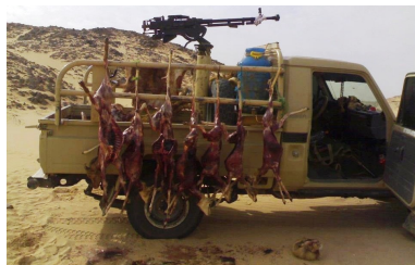
Hunting of wild gazelles in the Sahara