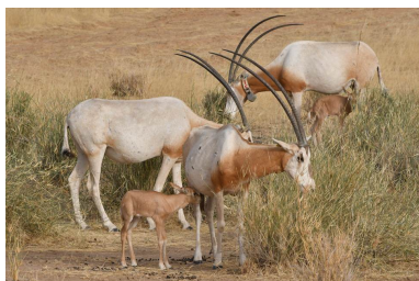
Gazelles grazing in grasslands in Chad following their release into the wild