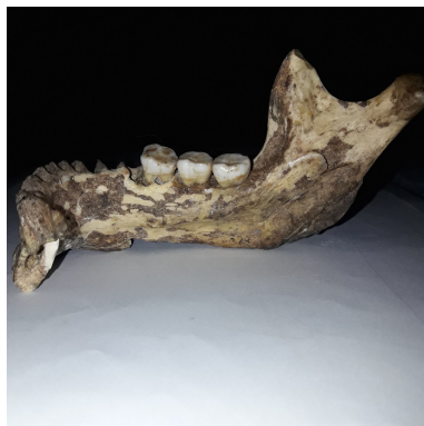
The Carigüela jawbone—one of the most outstanding elements of this study, dated 8,000–5,500 BCE. It constitutes southern-most human remains found to provide genetic data.