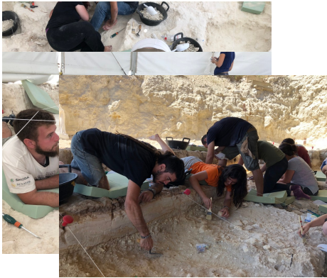
Photographs of the archaeological complex at Orce