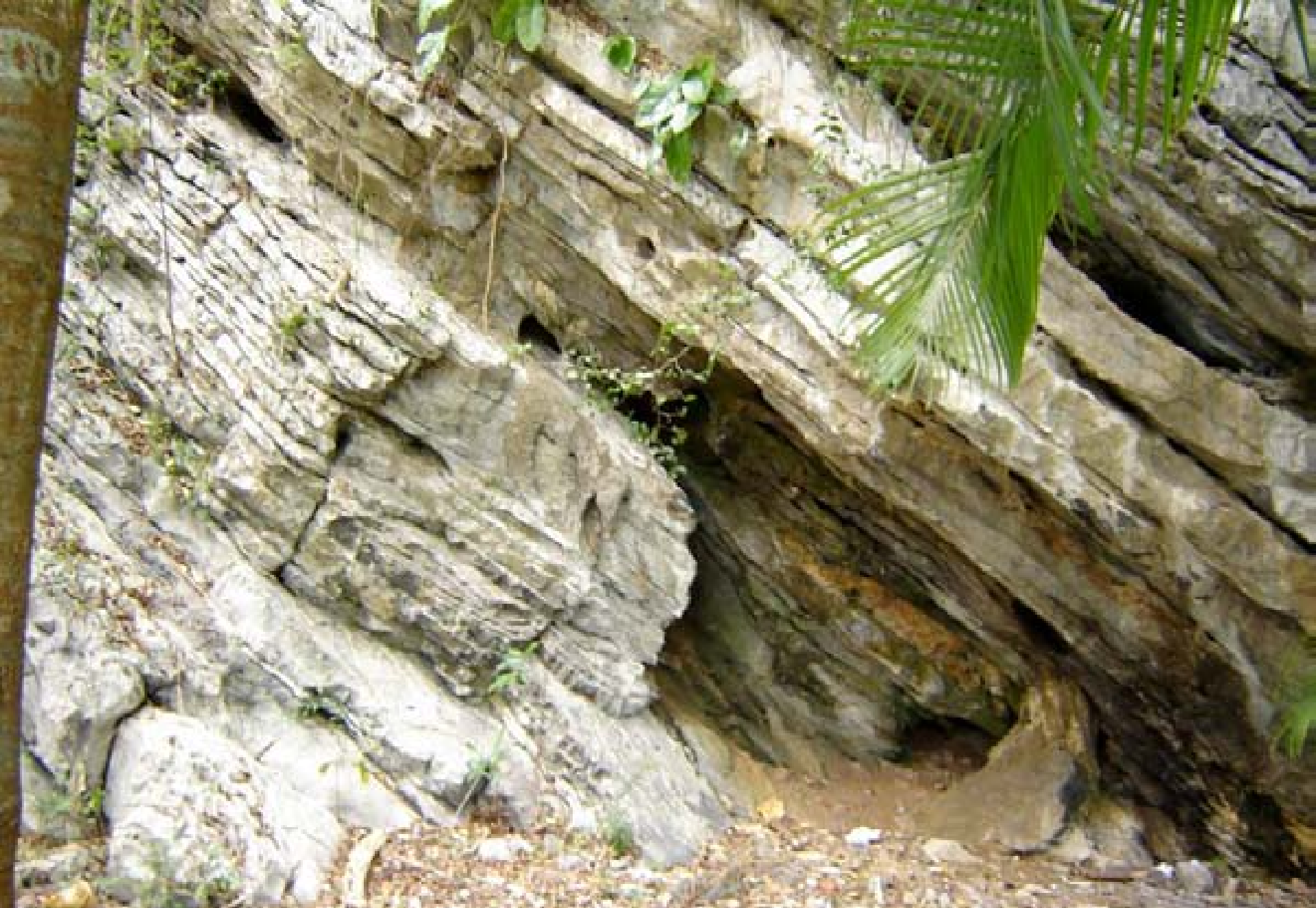
JURASICO SUPERIOR TITHONIANO