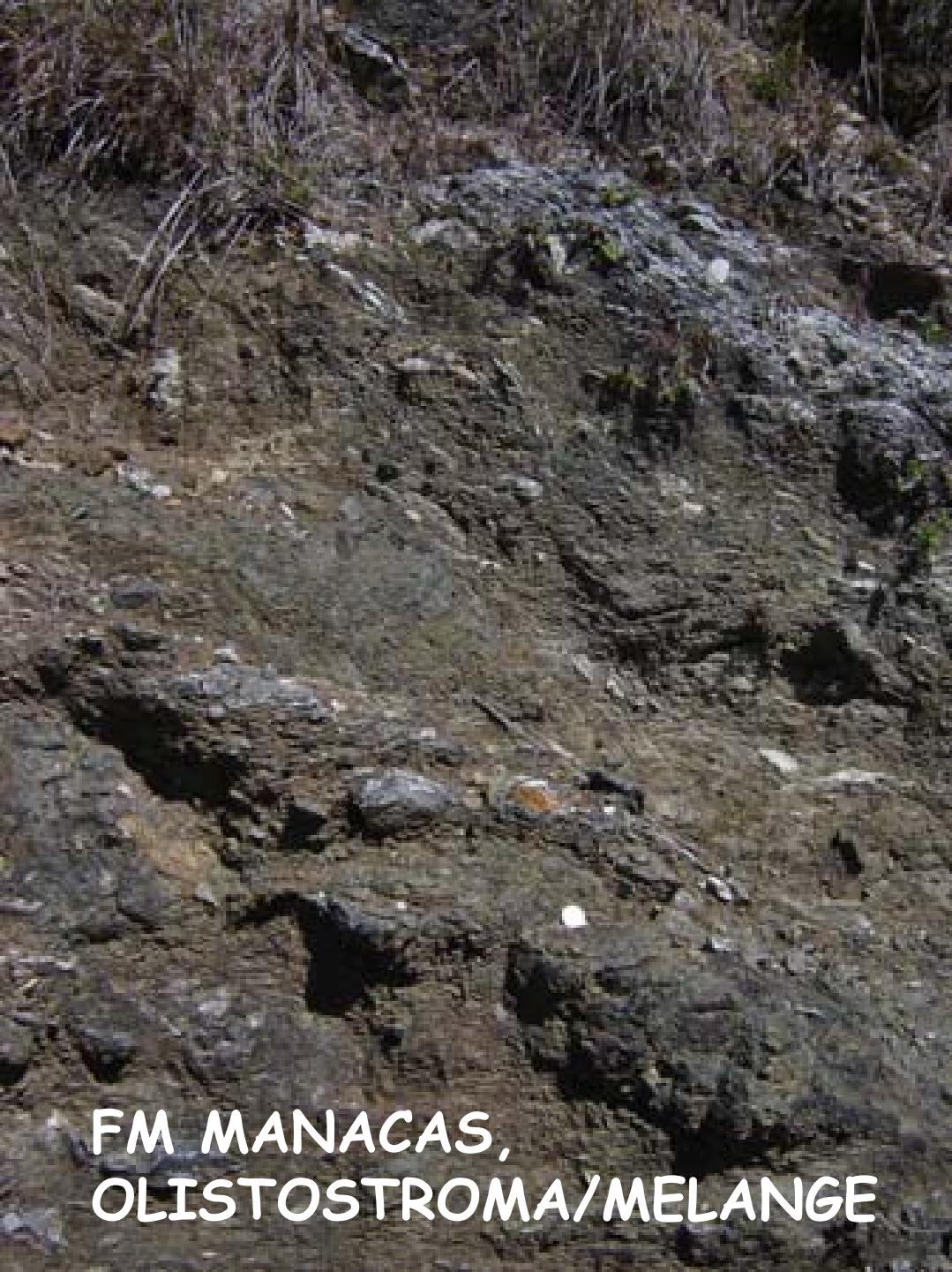
FM MANACAS, OLISTOSTROMA/MELANGE