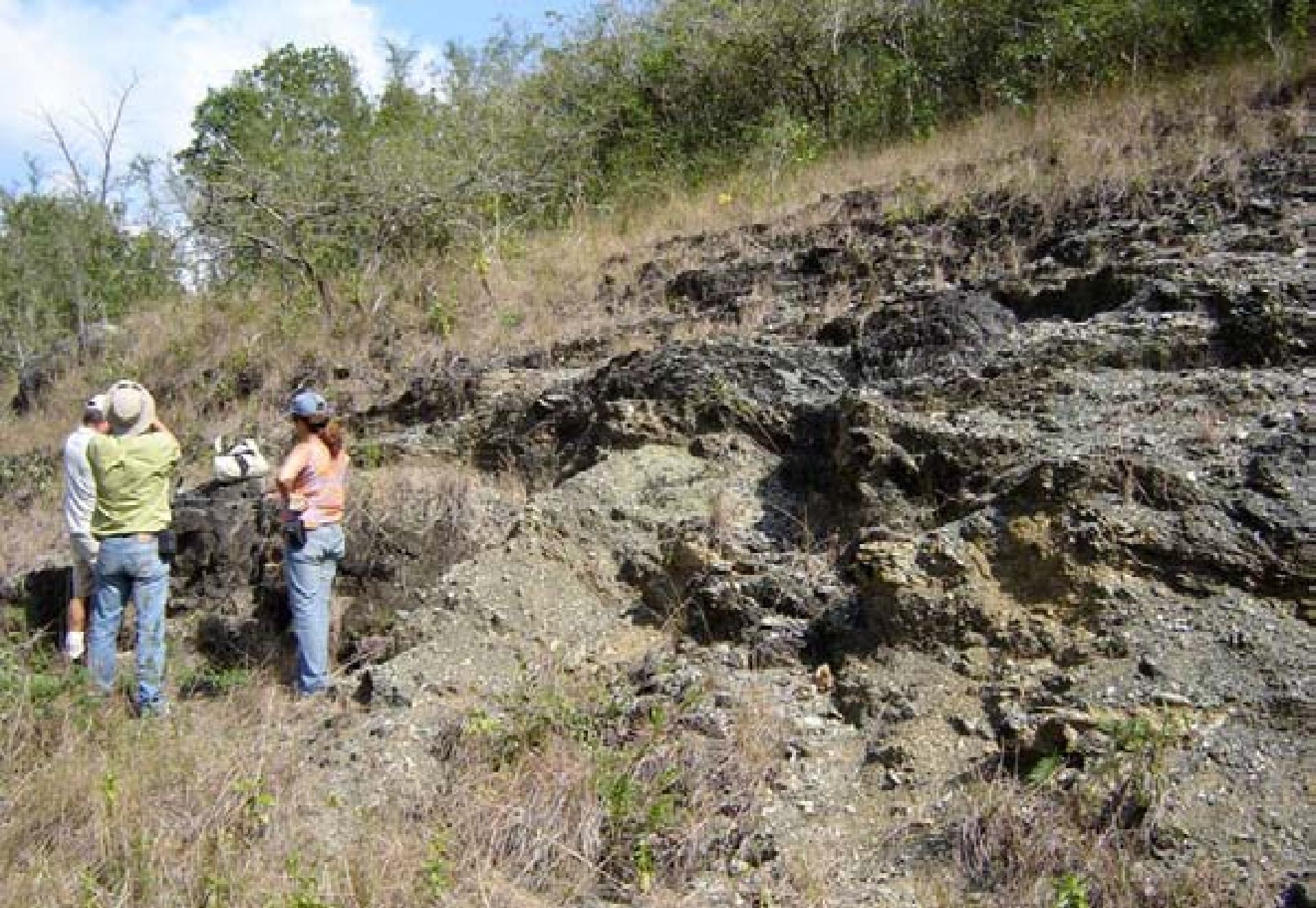
FM MANACAS, CERCA DE MONCADA