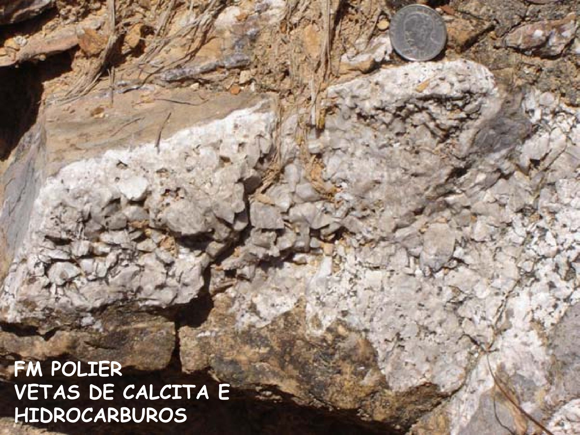
FM POLIER VETAS DE CALCITA E HIDROCARBUROS