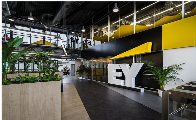
La sede de EY GDS Spain en Málaga TechPark.

Desde su lanzamiento en el Málaga TechPark en 2022, la organización se ha expandido rápidamente, atrayendo y desarrollando a cientos de profesionales